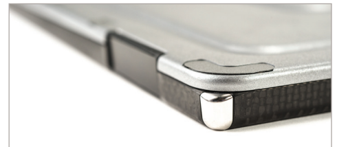
Austenite corners protect against scratches and cracks.