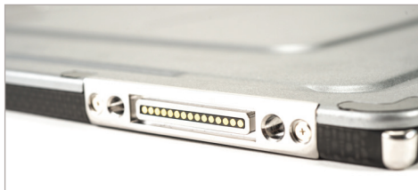
Magnetic connection for docking and charging.